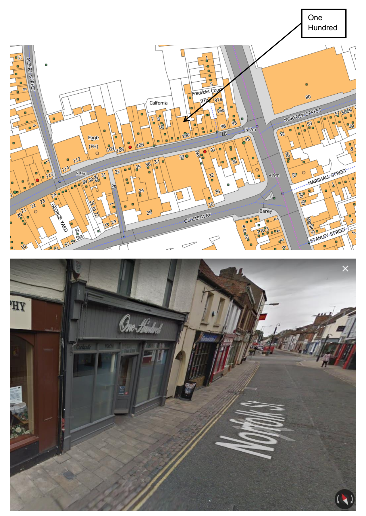
Plan showing One Hundred, 100 Norfolk Street, King's Lynn, Norfolk, PE30 1AQ